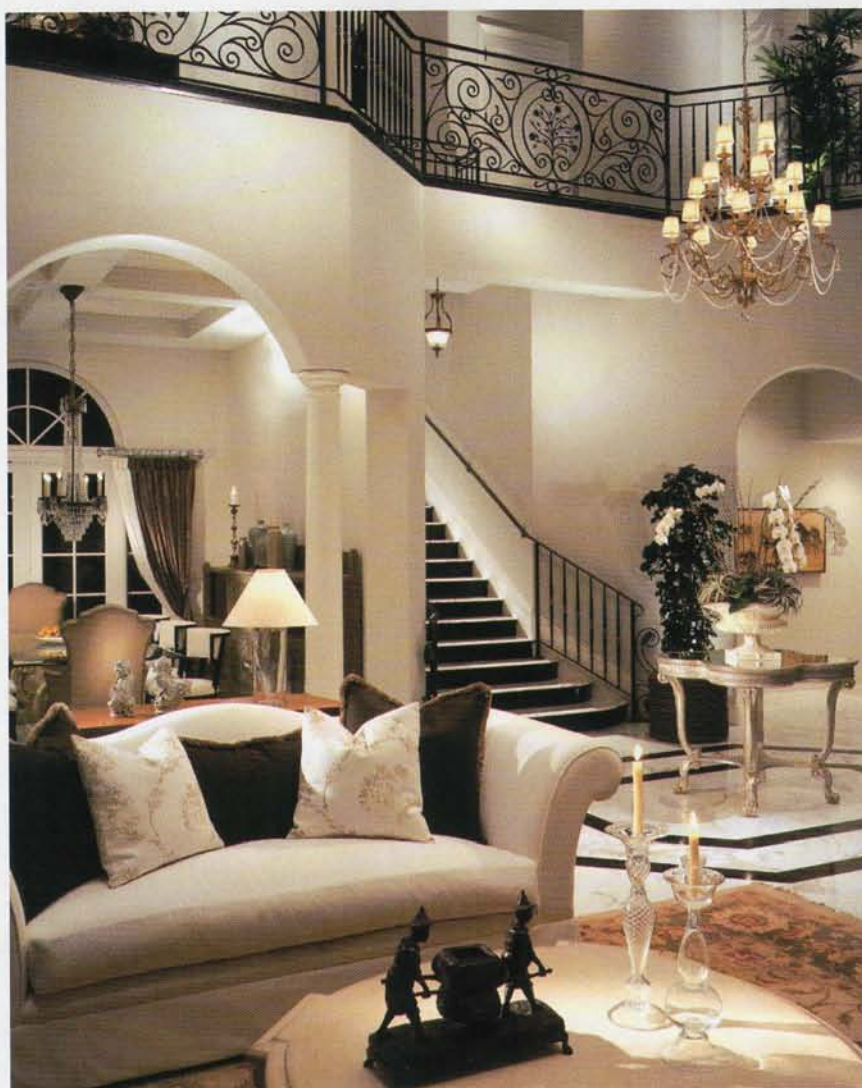
LEFT The wood and marble staircase features custom ironwork. The foyer table at the foot of the stairs was custom made for the space. OPPOSITE The living room fireplace is made from imparadora brown marble with gold veining. The mirror on the wall above it is custom-made using gold leaf.

of the family room, while a chenille-covered sofa, accented with animal-print pillows, provides seating for relaxing and entertaining.