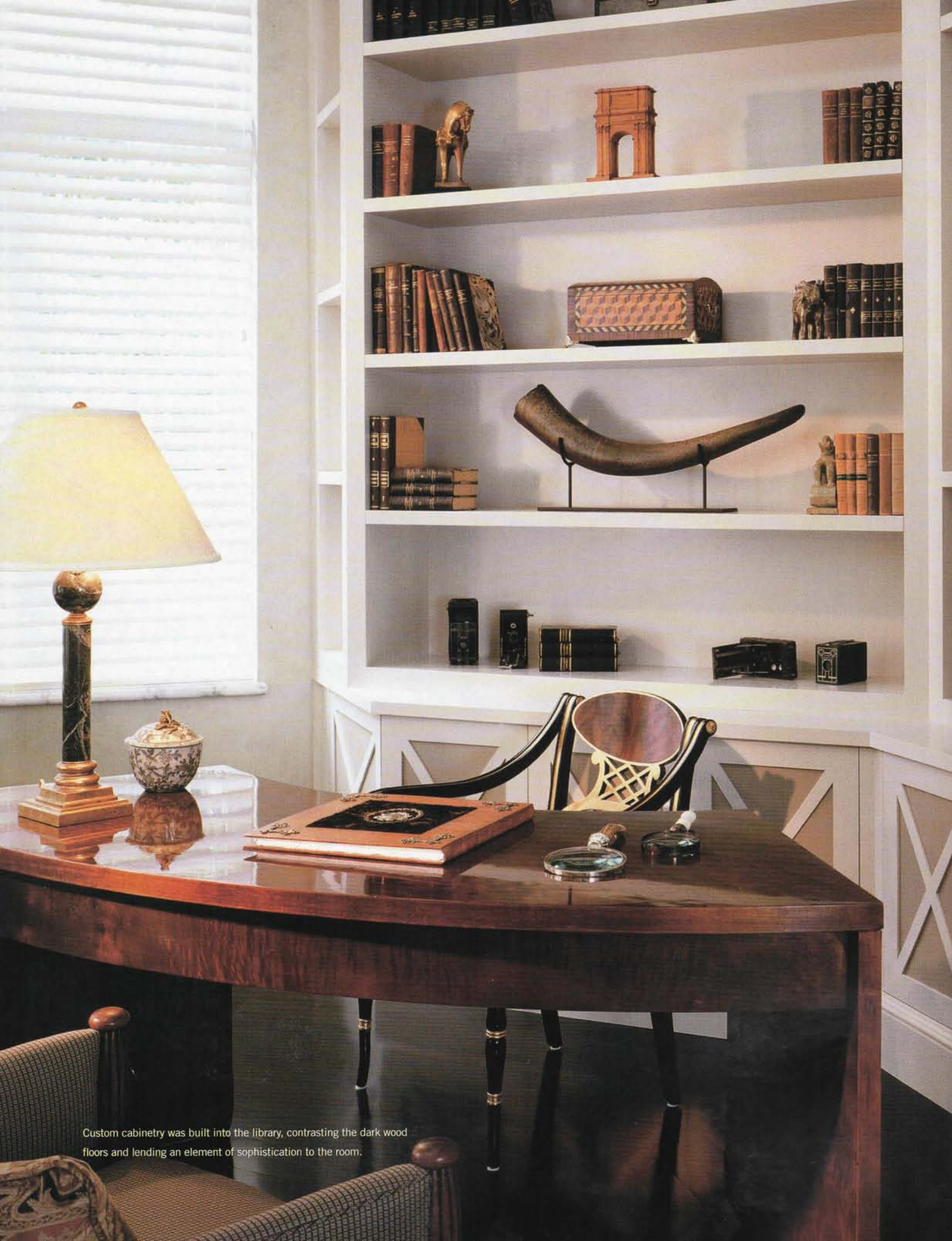
Custom cabinetry was built into the library, contrasting the dark wood floors and lending an element of sophistication to the room.